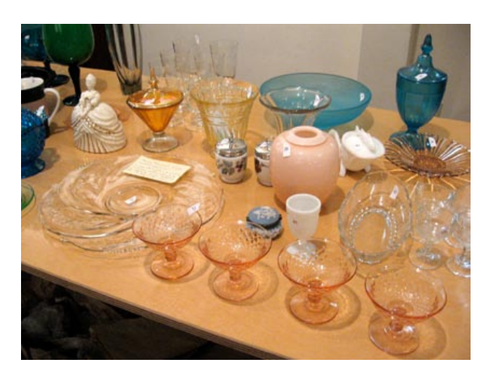
Auction Fun in November